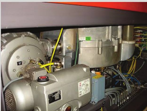
BOMBA DE VÁCUO