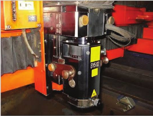
CABEÇOTE CO2 E FIBER