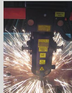
CABEÇOTE CO2 E FIBER